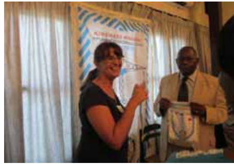
Exchanging Rotary banners in Kinshasa.

The theme of our visit was UPC's slogan: "Education that builds a nation". We introduced ICA's participatory processes to university students, young business executives and the community; and saw classrooms of mud bricks that had been rebuilt countless times after tornado or other violent weather. We toured two CDCC hospitals in Bolenge and Lotumbe with the pragmatic and resourceful local medical coordinators and rural health zone doctors and celebrated Lotumbe's new hospital latrines, made possible by Australia's Pink Umbrella Foundation. We shopped in Lotumbe's community store, a HandUp