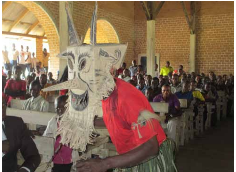
Checking the demons at Sunday service in Lotumbe.

However, Lotumbe leaders hold the vision and have started strategic planning and networking with 10 of the 22 other remote villages. Following HandUp Congo team's visit, they agreed to add Lotumbe to the pilot program list, which will lead to further up skilling, networking and replication.