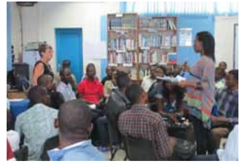
Facilitating Sustainable Community Development workshop at UPC, Kinshasa.

Four groups – children, youth, women and men – had the assignment of articulating "What is working well in Lotumbe? What do we want to improve? What can you/we do? What new or different roles are needed? Next steps?" as well as to create a song about their plans. The plenary session was marked by a wealth of ideas, will and joyful songs and dancing.