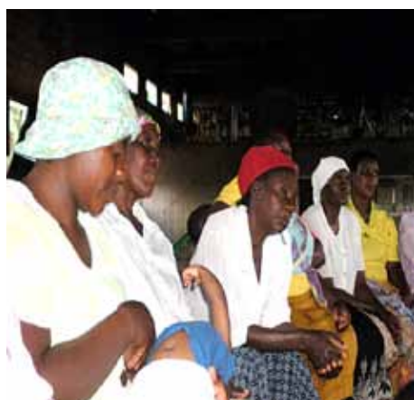
Women waiting to be tested.

The campaign is under way in eight communities this year and will be followed by 12 in 2015- 2017. We hope to eventually have a prevention manual or tool kit that communities which wish to undertake a similar project can refer to and adapt. Staff