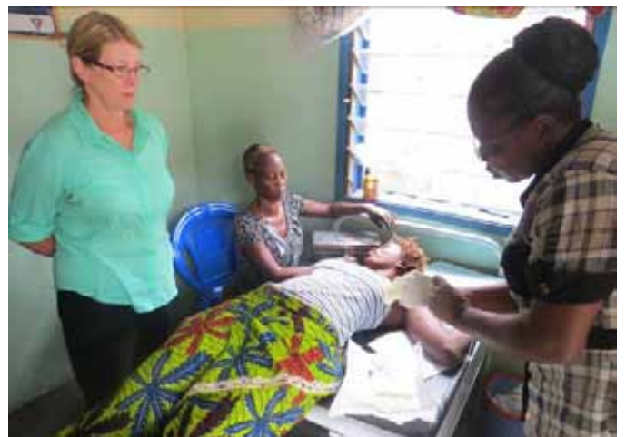
Birth control clinic in a back street of Kinshasa.