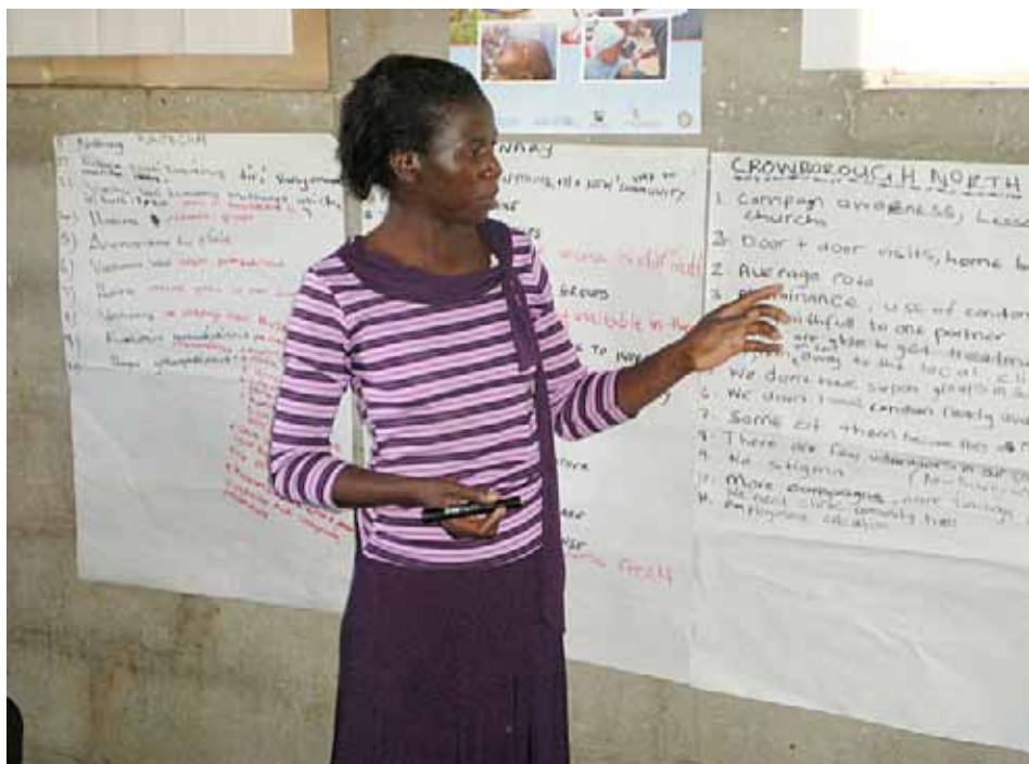
Crowborough North participant leading a workshop.