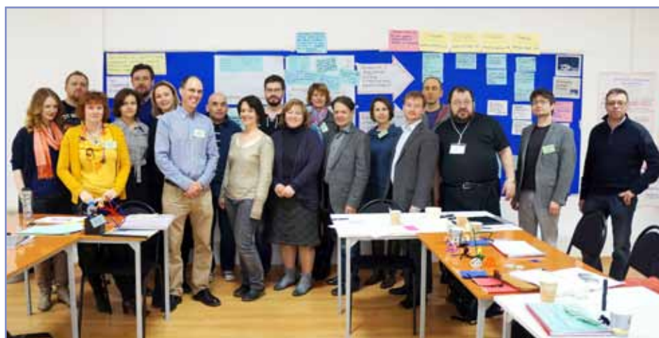
Moscow facilitators study the ToP Participatory Strategic Planning by planning ‘What can we do over the next 3 years to promote a culture of participation in our organisations?’