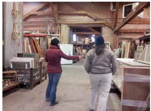
Meetings of the SLN are hosted by members on-site at their work, thereby allowing for in-depth sharing with one another about ways they are engaged in sustainability. An SLN gathering occurs here at the Rebuilding Exchange which collects materials from the demolition of old buildings for recycling into new construction.

Answering these questions is crucial for the future as communities everywhere come to terms with the urgency of the environmental crisis facing us today. □